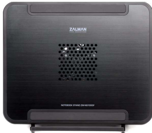
Notebook Cooling Stand