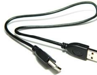
USB Power Cable